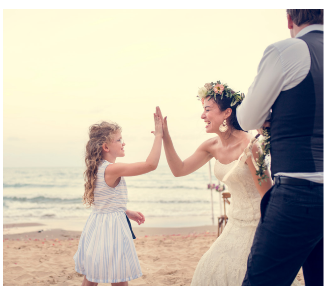
*Any dietary requirements can be catered for. Please let our wedding planner know of any requests.